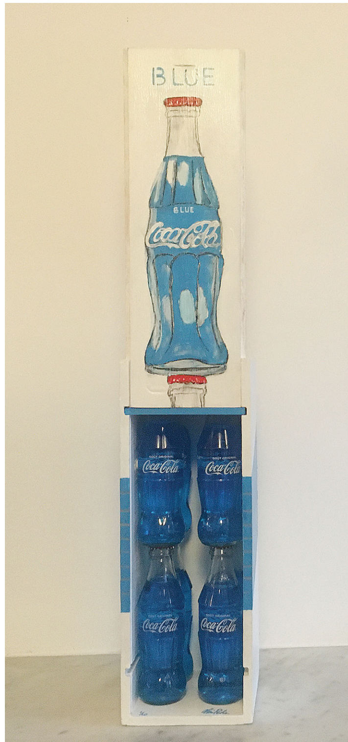
COCA-COLA BLUE OCTO BOX. 2020

Wood painted box with 8 ( octo) glass bottles of coca-cola Blue. Family pack